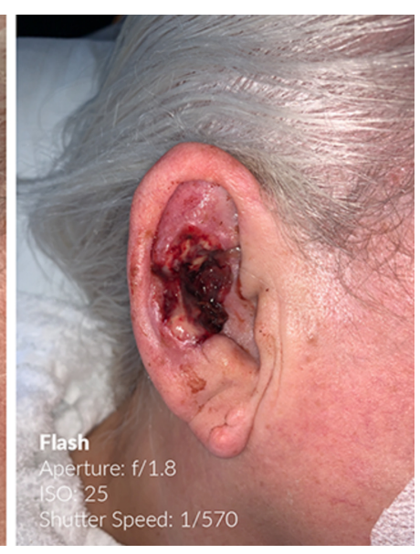
Fig 2 | Lighting postoperative photographs of a patient's ear after tumour removal, taken to aid discussion with secondary care over the assessment of granulation tissue. Left. Image was taken with a low degree of ambient light and no flash, leading to the camera setting a slow shutter speed resulting in motion blur. Middle. The introduction of daylight reduces in motion blur, but the angle of the light combined with the shape of the ear creates multiple shadows. This makes it difficult to identify the presence of healthy granulation tissue and absence of desiccation necrosis. Right. Turning on the flash to increase the quantity of light allows the mobile device to use a faster shutter speed and lower ISO while also providing more effective cavity illumination due to the close proximity of the flash to the camera lens.