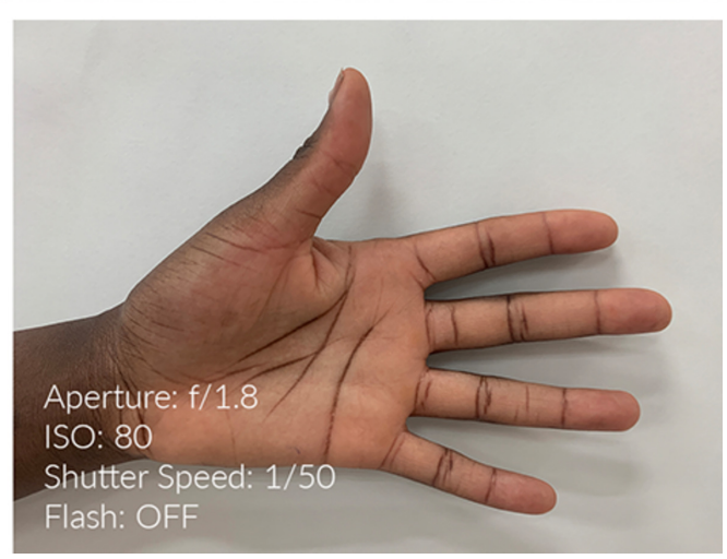
Fig 4 | Using a brightly coloured background can deceive the camera's auto white balance (AWB) setting into determining the scene may be "warmer" or "cooler" than it is in reality. This leads to inaccurate colour reproduction (left images). To assist the device's AWB system, use a plain white or colourless background, use flash or daylight, and ensure there are no mixed light sources (right images).

Ultimately, the information the user wants to convey in the image determines the emphasis placed on achieving accurate colour reproduction. For example, a quantitative study on diagnostic accuracy for common skin lesions based on colour versus grey-scale dermoscopic images found that morphologic characteristics, and not colour, were the primary diagnostic clue. Colour accuracy may therefore be secondary to the accurate documentation of morphology.