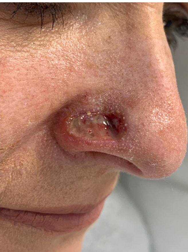
Fig 3 | The minimum focus distance at which a mobile device camera can focus is usually around 8-12 cm. When photographing small lesions, it is tempting to breach this distance to show the lesion close up. This results in focus past the area of interest (left image). With the increase in resolution of modern devices, photographing the lesion further away and then zooming in retains sharpness and clarity (right image zoomed to 100%)