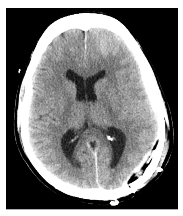
Fig. 5. Post-operative CT appearances.