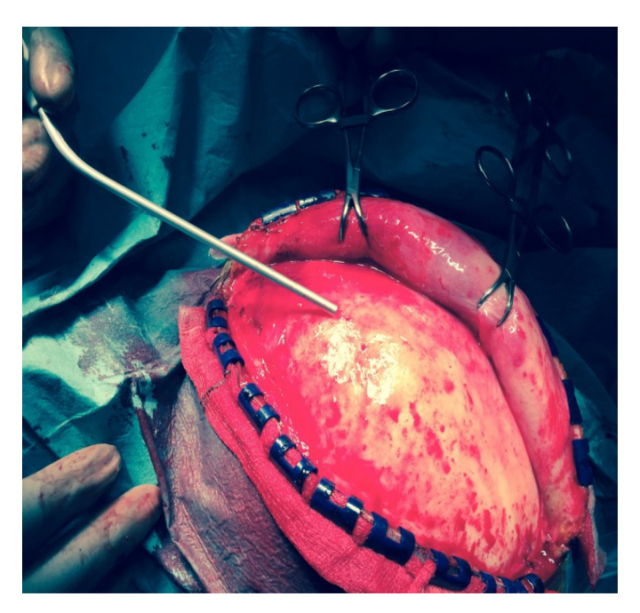
Fig. 3. 10 craniostomy needle track, evident during the subsequent definitive craniotomy.

presence of significant scalp swelling might necessitate the use of a longer needle. In this case the procedure took 8 min and did not delay craniotomy as the patient was stabilised and prepared for craniotomy simultaneously. However, we envisage that emergency practioners doctors could perform this procedure in district units directed by telephone on needle placement with respect to key landmarks by the receiving neurosurgeon who has reviewed the CT imaging remotely. This might be especially helpful in cases where transport or other delays are encountered- IO needles are characterised by their ease of use and universal availability in hospital emergency depratments. We propose the site of insertion should be the point of maximal clot depth and therefore localisation of the insertion point would be on a case by case basis. Most extradural haematomas requiring emergency craniotomy are of sufficient size that we postulate that failure to place the needle into the haematoma is unlikely but a potential complication. We also note most extradural haematoma is of solid