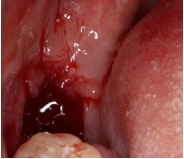
Fig 2 Generalised "ooze" from a lower wisdom tooth socket