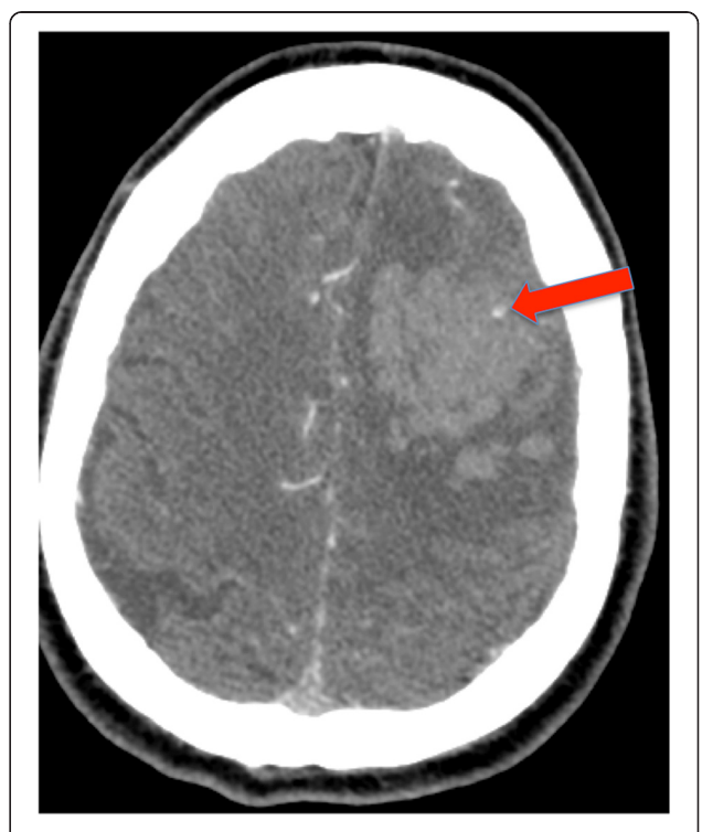
Fig. 3 Spot sign. Initially described as contrast extravasation on CTA, the term has evolved to encompass foci of enhancement within the hematoma on CTA ( red arrow )