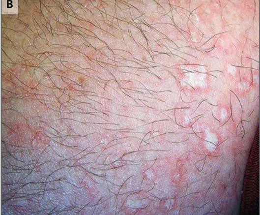
Figure 1. Clinical Photographs of the Patient. Panel A shows the patient's forehead, with multiple small, white, atrophic and crusted papules with violaceous borders. In Panel B, lesions on the thigh consist of porcelain-white, slightly depressed papules.

the legs, and women are more frequently affected than men. Livedoid vasculopathy may be a primary condition, or it may be caused by varicose veins or an underlying hypercoagulable state (e.g., the antiphospholipid syndrome, factor V Leiden mutations, antithrombin III deficiency, protein C or protein S deficiency, and hyperhomocysteinemia). Although the specific morphologic features of primary lesions are common to malignant atrophic papulosis and livedoid vasculopathy, the distribution of plaques and their associations are different. On the basis of the distribution of lesions in this patient, livedoid vasculopathy is not a likely cause.