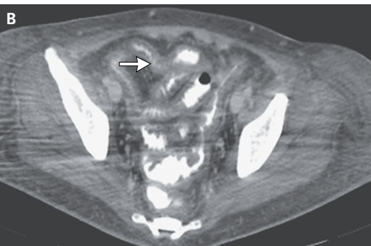
Figure 3. CT Images of the Abdomen. Coronal (Panel A) and axial (Panel B) contrast-enhanced CT images of the abdomen show diffuse thickening of the small-bowel wall (arrows), a finding that is consistent with edema. Diffuse subcutaneous edema (Panel A, arrowhead) is also seen. There is no evidence of bowel-wall perforation or omental infarction.

ing mucosal erythema (Fig. 4A and 4B). There was ill-defined plum-colored discoloration of the antimesenteric surface of the small intestines and punctate foci of acute hemorrhage in the surrounding mesenteric fat. Microscopic examination confirmed a widespread obliterative vasculopathy of the gastrointestinal tract, with intimal hyperplasia, luminal stenosis, and preserved internal elastic lamina. There was no granulomatous vasculitis or fibrinoid necrosis, although several vessels contained lymphocytes in their walls and some contained fibrin thrombi (Fig. 4C, 4D, and 4E). Examination of skeletal muscle at