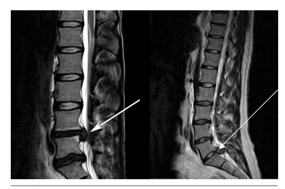
Fig 2 | Left: MRI scan showing compression of the cauda equina (arrow) due to a large posterior disc herniation at L4/5. Right: MRI scan showing a large disc herniation at L5/S1 (arrow) bulging posteriorly and compressing the cauda equina

When a patient has clinical features of cauda equina syndrome and an MRI scan shows a potentially reversible cause of pressure on the cauda equina then current consensus recommends surgical decompression.<sup>6</sup> This article will not review management of all the conditions leading to cauda equina syndrome, and some causes such as tumour clearly require detailed assessment of the nature and extent of the pathology. However, most cases of cauda equina syndrome are caused by herniation of the lumbar disc, for which the surgery indicated is